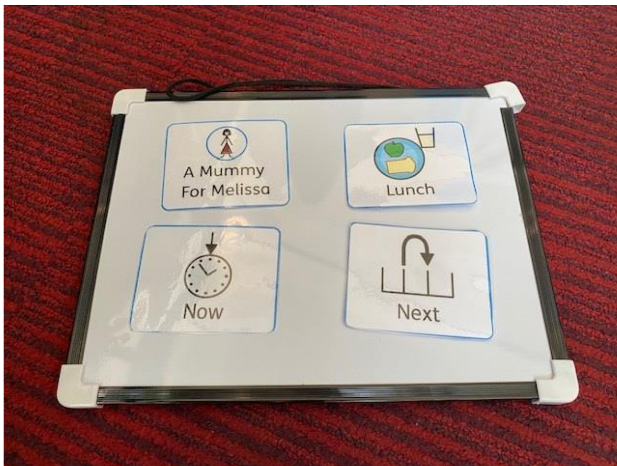
Figure 2. The magnetic timetabling cards can be used on the magnetic whiteboard to display a plan for the day ahead.

These items were chosen based on feedback from a questionnaire sent out to SEND teachers at the start of the project and have since been tested with SEND audiences as part of a specially run trial session and in ad-hoc instances during our summer public program. The feedback from these trials can be seen in the following section. As well as the purchased items, the backpacks also include a copy of our visual story so that visitors have easy access to it, and Figure 2 shows a magnetic timetable that can be personalised for each visitor, which was made in-house for our particular set of shows.